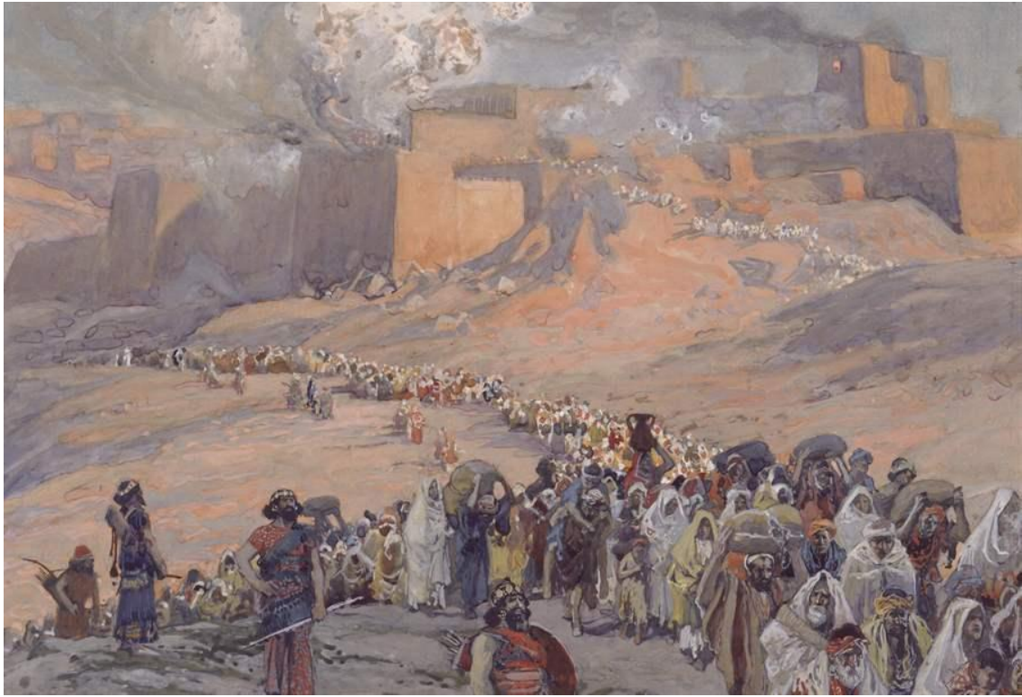
The Flight of the Prisoners , c. 1896-1902, a portrayal of the exile to Babylon.